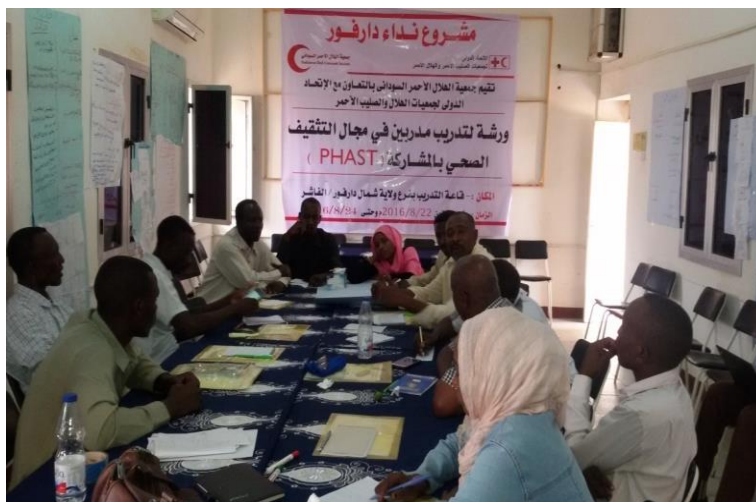
PHAST ToT Workshop in El Fasher, North Darfur, August 2016