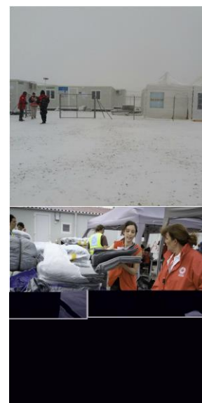
Distribution of winter NFI items.

In response to the winter season, the IFRC, in coordination with the Luxembourg Red Cross and Hellenic Red Cross supported the winterization of shelters in Cherso 2 and Kordelio sites. Based on the winterized package assembled by the UNHCR shelter working group, the IFRC assembled similar packages for each family on those sites. In collaboration with UNHCR who provided tents and winter kits, the IFRC winterized a total of 454 shelters, with a total of the following items distributed: winter kits for tent (222); pallets for flooring (1,660); insulation for the flooring; tarps 5 pc/pack (561); and heaters (86+ additional pieces as per needs including continuous supply of kerosene). Winterization activities in Cherso were finalized on 2 November 2016 and in Kordelio on 21 of November 2016. Due to the extreme winter conditions in early January, the IFRC has also increased winter distributions in sites in northern Greece as well as in the islands including providing additional fuel heaters as needed. Emergency WASH measures were also implemented in the sites in northern Greece due to frozen pipes. The operational teams are continuously monitoring the situation, together with camp managers and authorities for any future winter needs. In addition, through inter agency networks and coordination, the