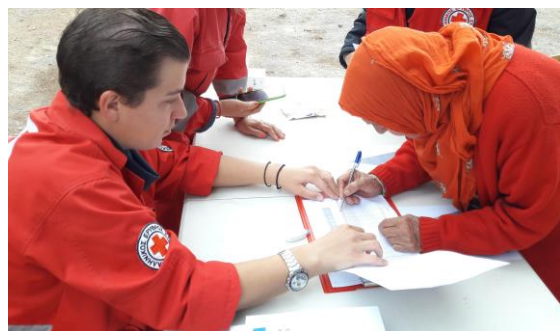
Cash distribution activities in Ritsona

The Hellenic Red Cross has been operating a reception centre for unaccompanied minors in Volos (Central Greece) since 2008. The program, with capacity of hosting up to 48 minors, was initially funded by the European Refugee Fund and then in 2015 passed on to the Ministry of Labour, Social Security and Social Solidarity with financial support of the International Organization for Migration (IOM) in Greece. However, payment to the food caterer has been outstanding since 1 September 2016. Therefore, contributions from this appeal will be funding the food catering from September 2016 to February 2017, including minor rehabilitation works. The main responsibility for this centre remains with the Ministry of Labour, with planned funding assistance from the IOM in 2017.