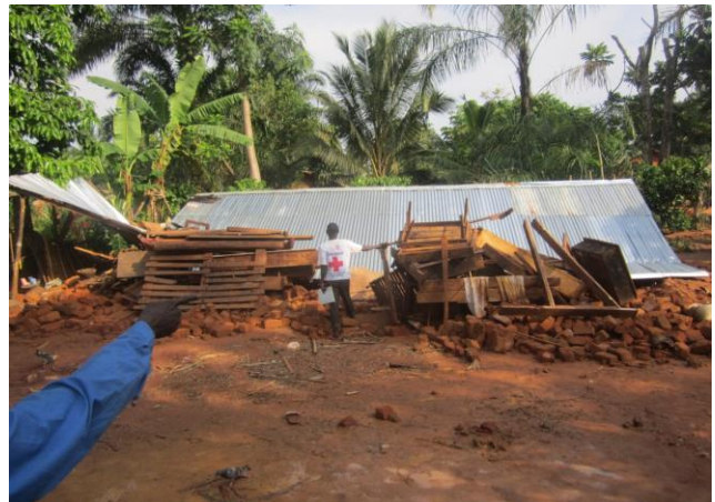
Flooded houses in Gemena Township

On 9 November 2016, rain and violent winds intensified, causing extensive floods in the Gemena neighbourhoods located on the banks of rivers Mombonga, Sukia and Labo.