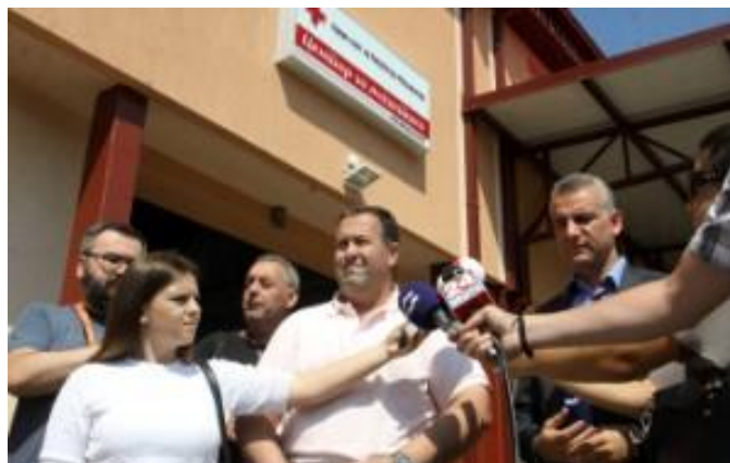
Press conference by the National Society's Secretary General.

The Red Cross of the former Yugoslav Republic of Macedonia developed press releases for the media, and held briefings and coordination meetings with stakeholders and published reports about the completed activities on a daily basis. The regular publishing of information through both traditional and social media about the ongoing activities and progress, including the amount of donations generated, aid received and distributed helped ensure full transparency towards the public.