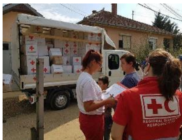
Distribution and assessment together with the Regional Disaster Response Team members.

As there was no significant damage caused to the mobile and landline phone network infrastructure, communication was mostly handled through mobile handsets (simplex line up to 2 km) and mobile phones.