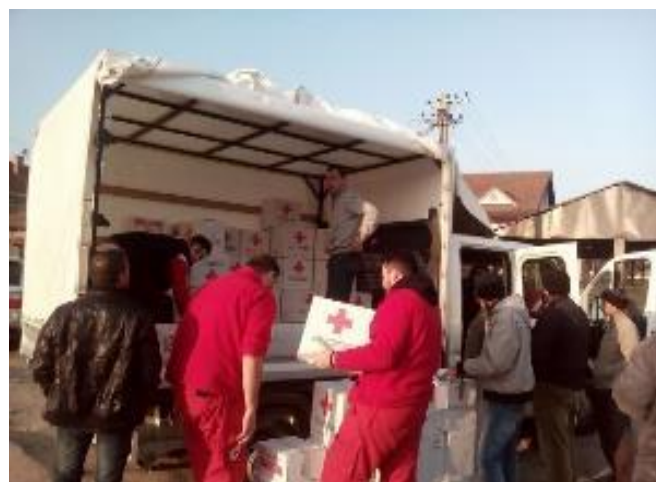
Relief distribution by staff and volunteers of the Red Cross of the former Yugoslav Republic of Macedonia.

In the Tetovo region, the heavy rainfall resulted in the flooding of roads between the villages Shipkovica, Brodec, Veshala and Poroj isolating these four localities.