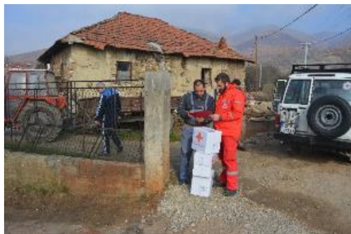
Distribution by a National Society staff in one of the flood-affected communities.