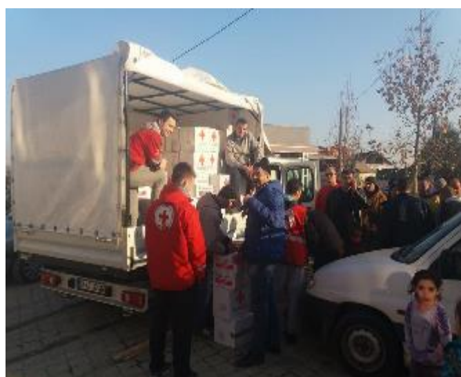
Distribution by Red Cross staff and volunteers in the flood-affected region.

The entire operation of the NS was supported by 110 staff and volunteers , divided in seven mobile teams for first aid and relief distribution. Volunteers were recruited and deployed from the different branches as well as partner organizations on a daily basis to conduct different activities such as packing and preparing relief items for transportation.