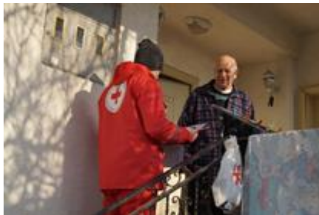
Field visit and needs assessment of beneficiaries affected by the disaster.

Risk assessment/management: Throughout the implementation of the operation, the Crisis Management Centre successfully coordinated the different activities. All participants in the operation were timely informed about the situation