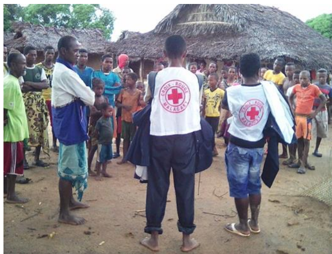
MRCS volunteers disseminating cyclone early warning messages to community members in north east coast of Madagascar

All staff at the headquarters and 22 Branch Coordinators have also been mobilized on this response and cyclone preparedness coordination meetings are being convened by MRCS together with the National Disaster Response Agency (BNGRC). MRCS took part in a joint aerial assessment organized by the Government on 13 March.