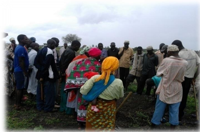
Figure 4: Field demonstration for farmers

The beneficiaries have been involved in identification and design of the Nyalani irrigation site. The local communities donated 170 acres of land and provided unskilled labour in clearing of the bushes and removing of stumps and shrubs from the farm. After the design and rehabilitation works were complete, the farmers were allocated a quarter an acre for each household to carry out their farming activities. To support farm operations, the Red Cross supplied farm inputs and implements to farmers, trained farm operators and put in place a functioning irrigation infrastructure. An agronomist from Amiran was also engaged to provide extension education to farmers. As a result of this support farmers have started reporting good harvests, improved nutrition and increased income.