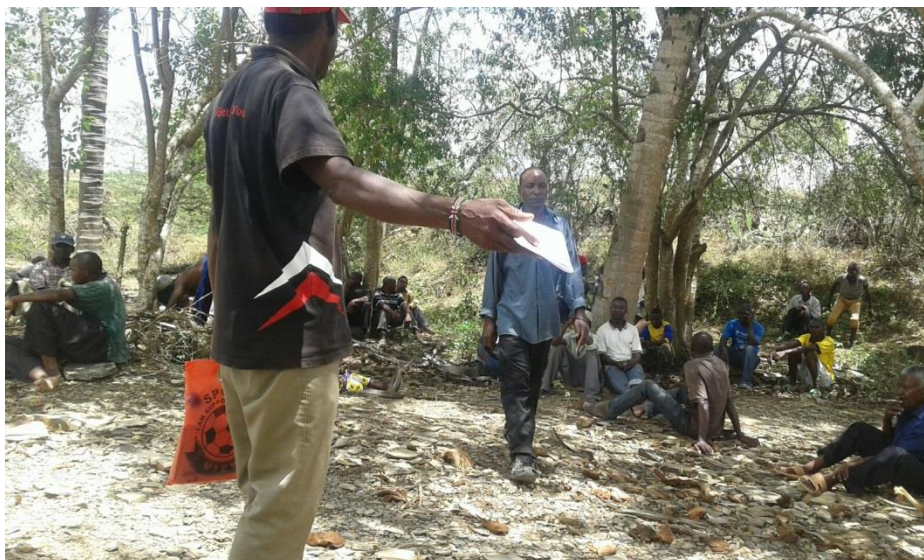
Figure 1: Community consultation on committee members' selection

The key activity under this objective was to review the community committee constitution and ensure that it had one-third composition of women. Through awareness creation, the project ensured that the community structures adhered to the one-third gender rule. Further, during the training of CHVs(Community Health Volunteers), the selection of participants considered the one-third gender rule such that 82 men and 61 women were trained.