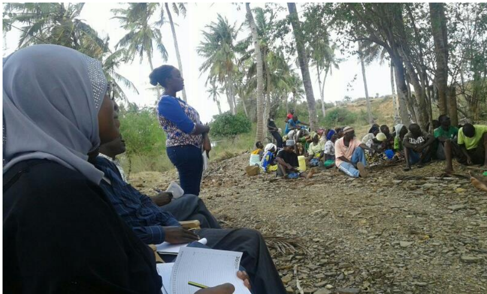
Figure 2: KRCS project team meeting with community

The main activity was to plan and hold monthly meetings with the committees and community members to brief them about the progress of the project. The project supported the community committee to conduct monthly meetings with the community to brief them on the status of farming activities at Nyalani. The CHVs were also coordinated to carry out monthly meetings to discuss issues relevant to their work.