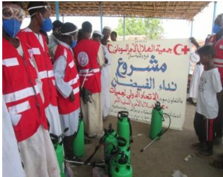
Volunteers' conducting spraying campaigns in targeted communities- Sennar State

5 September 2016: IFRC issues Emergency Appeal for 3,258,282 Swiss francs. SRCS is targeting the five worst affected states for the emergency respond, namely Kassala, Sennar, Gezera, West Kordofan and White Nile, based on the extent of damages and impact of the disaster as well as the response capacity of the National Society.