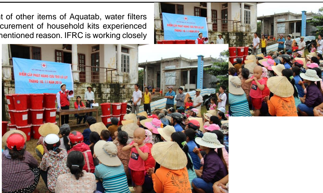
Household kits distribution in Quang Binh province.

Similar to the procurement of other items of Aquatab, water filters and water containers, procurement of household kits experienced dramatic delay due to the mentioned reason. IFRC is working closely with the VNRC's operation team to speed up their process. The purchase is planned to complete in June.