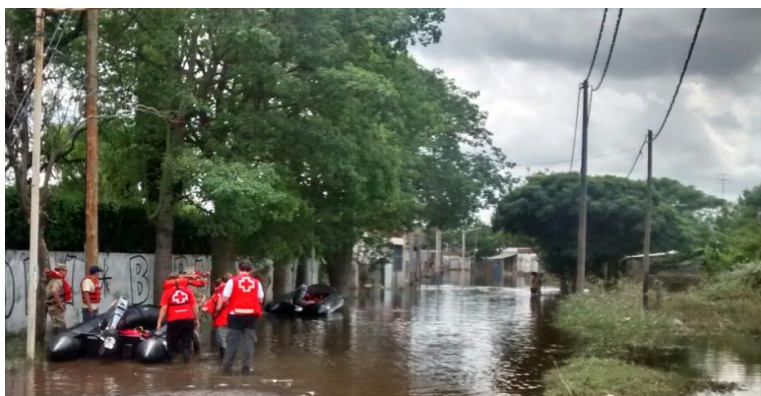
Teams of Argentine Red Cross volunteers carry out rapid assessments of the most affected areas together with the Argentine Army. 27 December 2016.

Pergamino, a city in northern Buenos Aires Province (65 meters above sea level), was one of the most affected municipalities by the rain, receiving some 220 millimetres 1 of rainfall in four hours, which caused the Pergamino Stream, its