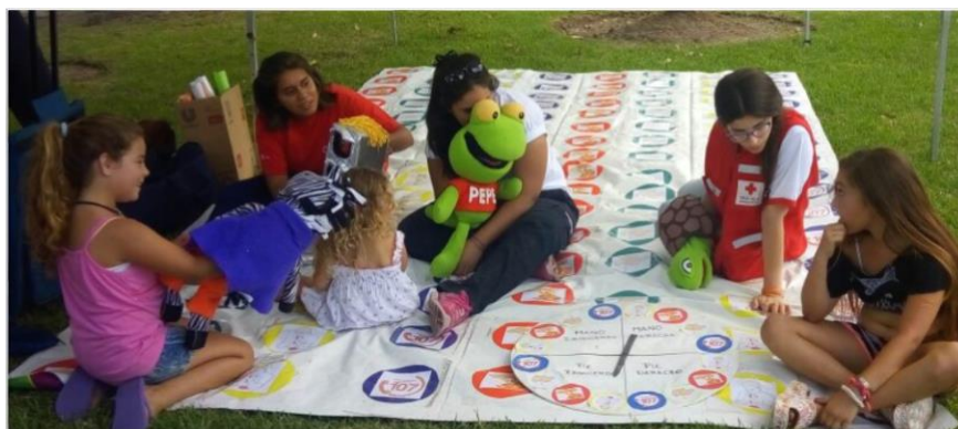
Psychosocial support sessions with children in Pergamino

The ARC provided psychosocial support sessions during the emergency and every activity it carried in the Pergamino and its affected communities; the ARC's psychosocial support sessions with adults included private individual or group talks, whereas the children's sessions used play, drawing or storytelling techniques. In addition, This activity reached a total of 650 families.