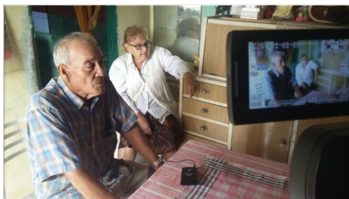
Recording of beneficiary stories - Pergamino

In March 2017, the communications coordinator and the Emergency and Disaster Response Directorate recorded three stories 3 involving CTP beneficiaries were recorded.