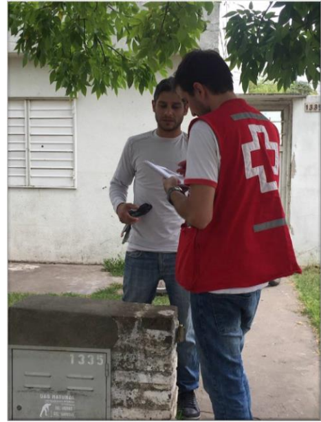
Beneficiary satisfaction survey for the cash transfer programme in Pergamino