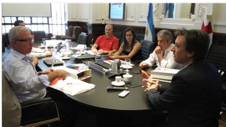
Second meeting with Pergamino city authorities, attended by Pergamino's mayor and the ARC's president

The ARC's headquarters coordinated actions on the ground from the very onset of the emergency to implement properly this plan of action; the National Society's Emergency and Disaster Response Directorate coordinated and monitored most of these processes, and arranged for the institution's participation in the city's EOC, various assessments and the cash transfer programme. It also monitored first-aid provision at the health post, beneficiary registration, delivery of early recovery cards, CBHFA workshops, and the provision of psychosocial support; moreover, headquarters' personnel deployed to the field actively participated in the municipal EOC, and the local government provided ARC with a working space within the same building where the EOC was based.