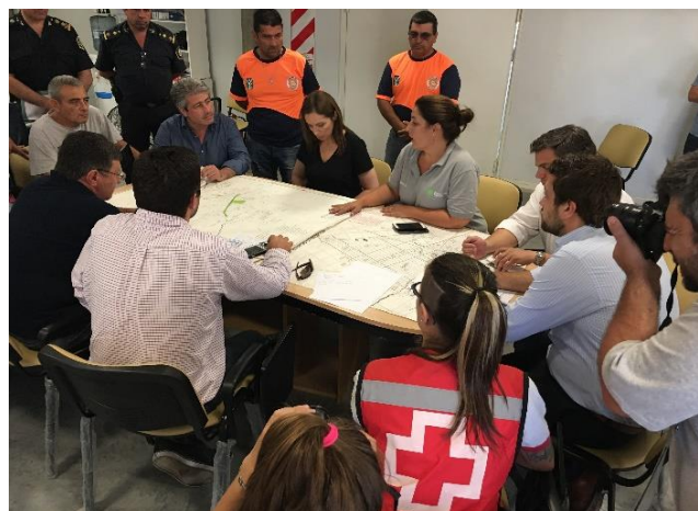
Participation in the Municipal EOC, together with the provincial governor, the mayor and other local and provincial authorities. 27 December 2016.

On 26 December 2016, a Red Alert was formally declared for the country network following heavy rainfall that caused flooding in northern provincial areas. Since the ARC does not have a branch in Pergamino and there were media reports of flooding in the area, a volunteer from the National Intervention Team (NIT) and the National Operations Coordinator travelled to the city of Pergamino to carry out rapid assessments.