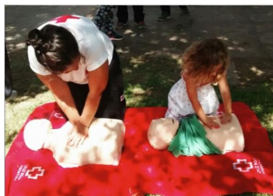
CBHFA workshop in Pergamino

Moreover, these topics were adapted for children through recreational activities, which had to be delivered by headquarters' staff over two different weekends because there was no branch in Pergamino to support the plan of action's activities. While talks were promoted and publicized by Pergamino's municipality and the health ministry, attendance was not as high as expected, and some families chose to stay home to continue with cleaning tasks and others had to return to their jobs.; consequently, the ARC could not fully achieve this activity's target.