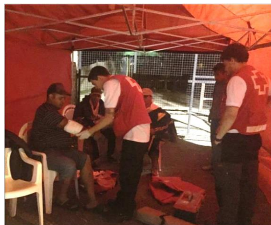
First aid post in Pergamino during the first week of the emergency.

A fixed first aid post was set up in 27 de Noviembre neighbourhood jointly with Pergamino's Health Department, where municipal fire brigade members and residents could come to receive any type of first aid care; the fixed first aid post provided total of 31 treatments during the operation's first week. Furthermore, the ARC established three additional mobile first aid posts, which moved around between the communities of José Fernandez, Kennedy and 27 de Noviembre. Volunteers remained alert to any unforeseen events requiring first aid, but no further treatments were needed during the remainder of the operation.