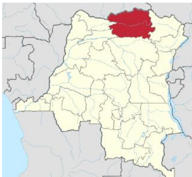
Location of the Bas – Uélé province (Capital: Buta) in the Democratic Republic of the Congo (DRC)

According to the Red Cross committee in North Ubangi province, these refugees are fleeing clashes between elements of the CAR Armed Forces and Balaka rebels in the province of Bangasou. According to a local press, these refugees, amongst whom are injured persons, pregnant women, as well as separated and unaccompanied children, arrive in difficult conditions with little personal belongings.