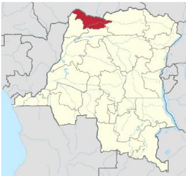
Location of the North Ubangi province (Capital: Gbadolite) in the Democratic Republic of the Congo (DRC)