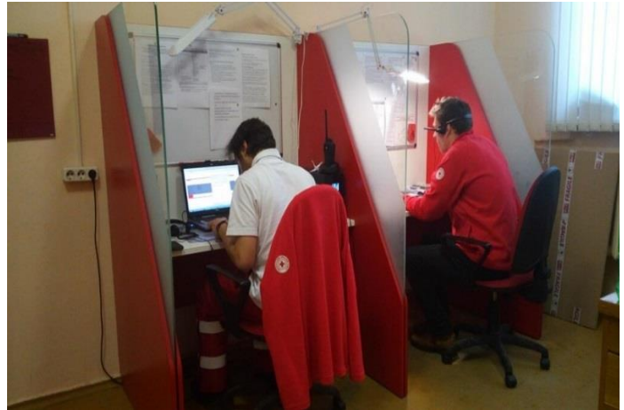
Volunteers of the telephone helpline 201 coordinate work of 25 mobile groups on the real-time basis.

During the severe cold weather conditions, the disaster response teams coordinated their activities and communicated with the help of the telephone line of Belarus Red Cross 201. Volunteers worked from 5 to 10 January by relays 24 hours a day. They also stayed in touch with the Republican centre of emergency coordination. When the weather conditions improved, the volunteers continued their work on communication during daytime.