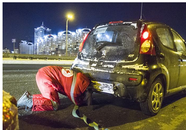
Minsk, a volunteer of the "ISLOCH" emergency team helps a stranded driver.

In total, BRC assisted 56,413 vulnerable people. This number includes 2,554 homeless people, who received hot meals and warm clothes, and 224 stranded drivers.