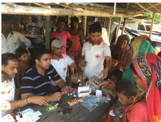
Medical camps organised by RC branch, West Champaran district, Bihar