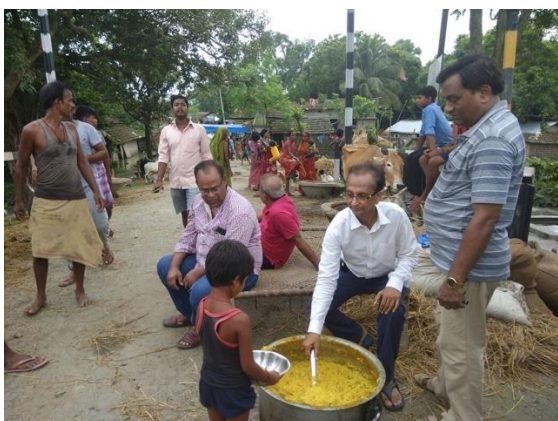
Community kitchen organised by the Katihar RC district branch, Bihar

IRCS NHQ organised a Skype call with Bihar state branch on 18 August 2017 to understand the current situation and needs in Bihar. This meeting was attended by all Movement partners. Headquarters immediately released relief materials from the regional warehouses. Additionally, IRCS also requested for support from both IFRC, ICRC and other partners.