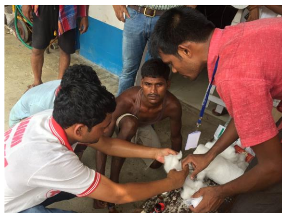
First aid and distribution of medicines by RC in Katihar district, Bihar, (Source: IRCS)