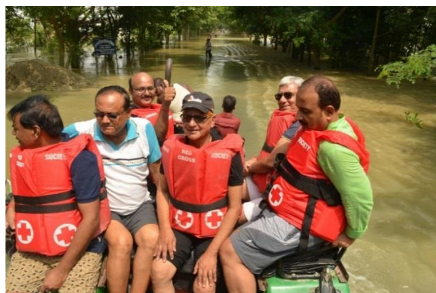
Volunteers in action in west Champaran district, Bihar, (Source: IRCS)

Based on the severity of impact in Bihar, IRCS is focusing its current support in the state. Nevertheless, as the situation is still emerging in the other parts of Uttar Pradesh and West Bengal, the national headquarters of IRCS is regularly communicating with the state branches to ensure it is fully informed of the evolving situation.