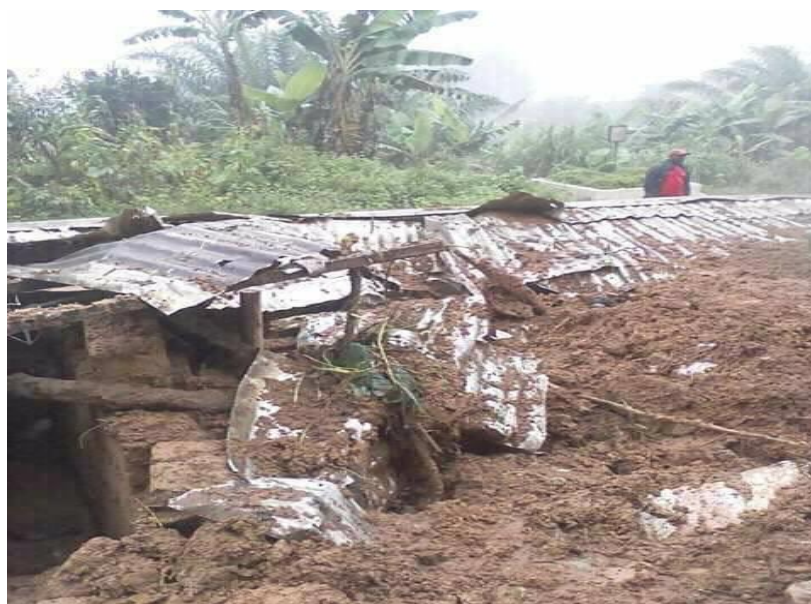
House destroyed by flash floods and mudslides in Santchou

Bélong: A town made up of three (3) villages of 2,700 people, was the most affected by these floods. Indeed, more than 70% of the population is affected with 50 families that have seen their homes completely destroyed, more than 20 houses partially destroyed as well as 500 plantations and schools destroyed.