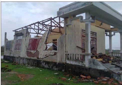
A damaged house in Quang Trach, Quang Binh

Typhoon Doksuri tore a destructive path across Central Viet Nam on Friday, 15 September 2017, as a Category 1 typhoon with maximum sustained winds of 135 kph (wind gust up to 185 kph), flooding hundreds of thousands of homes, whipping off roofs and knocking out power in the six provinces of Thanh Hoa, Nghe An, Ha Tinh, Quang Binh, Quang Tri and Thua Thien Hue. According to the Central Steering Committee for Natural Disaster Prevention and Control (CCNDPC), at least 14 people were killed, 112 injured and four others missing after Doksuri swept through Viet Nam on Friday and Saturday. The typhoon, the tenth to hit Viet Nam this year, caused widespread rainfall of between 100-250mm in provinces from Thanh Hóa to Thừa Thiên-Huế and left 1.3 million people without power.