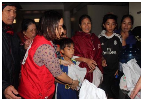
Distributing relief items at an evacuation centre in Ha Tinh.