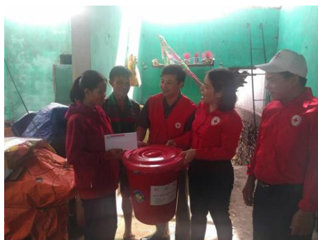
VNRC team visiting an unroofed house in Ky Anh district, Ha Tinh