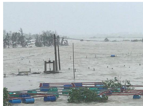
Some parts of Ha Tinh province were inundated