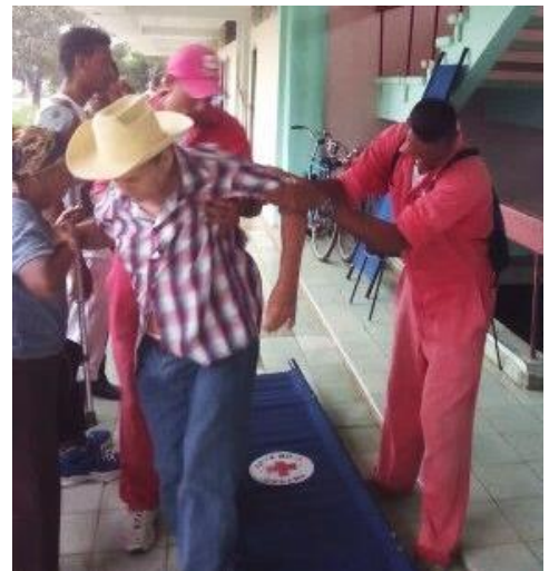
Photo: In the province of Ciego de Avila, Cuban Red Cross teams evacuated more than 1,000 seniors living in residential care centres.

28 September 2017: The IFRC issues a revised Emergency Appeal for 7,570,948 Swiss francs, adjusted to the assessed needs so far.