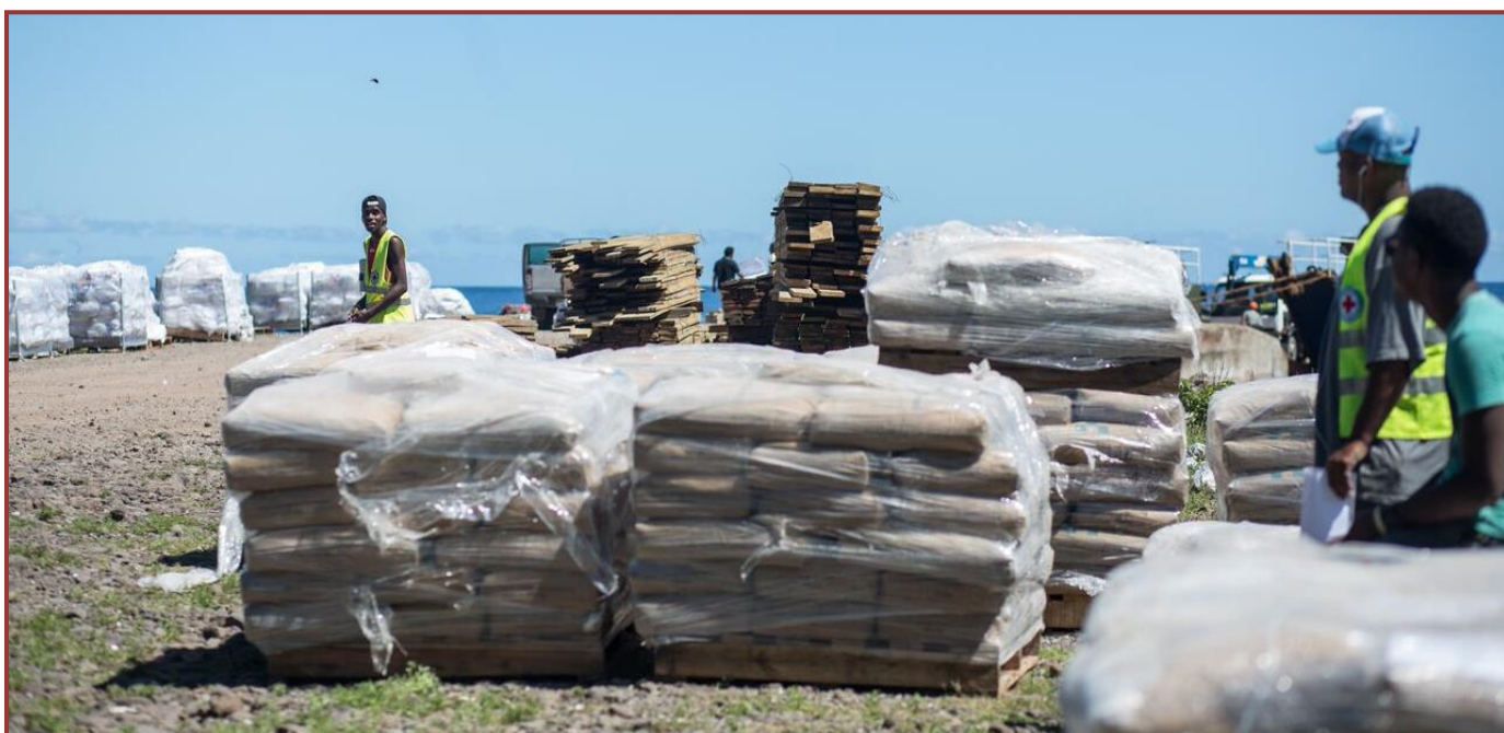
Fiji Red Cross volunteers during delivery of Build Back Safer kits to Koro Islands.