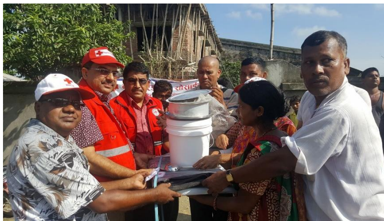
NRCS chairman and other governance volunteers visited flood affected districts and monitored the response operation.