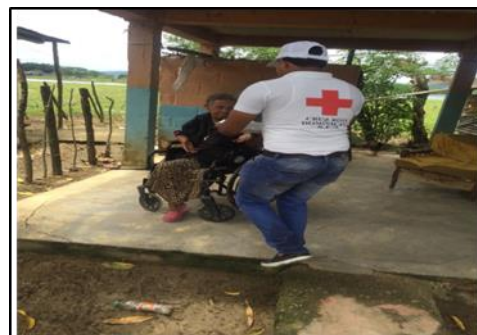
FA DRC volunteer delivers food to a beneficiary in Bajo Yuna.

A total of 3,723 families (18,615 persons) have been directly reached by the emergency humanitarian assistance actions of the Dominican Red Cross. Main actions in the 10 prioritized provinces include the distribution of the following relief items: