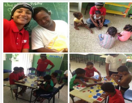
A DRC PSS team works with children from the affected zones in Villa Rivas.

The Dominican Red Cross has maintained permanent communication with the Ministry of Health; during awareness raising and epidemiological control actions, the provincial health coordinators were in permanent contact with the provincial health directorates. Joint actions were carried out in vector control, epidemiological follow-up as well as emergency first aid care, and DRC branches received instructions and coordinated with the provincial offices.