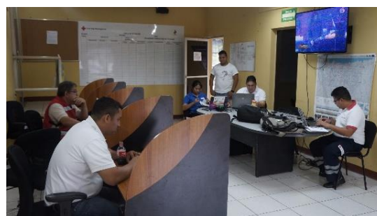
The Nicaraguan Red Cross Emergency Operations centre.