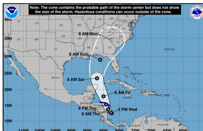
Tropical depression 16 route at 8PM EDT 4 October 2017

The Regional Forecast Centers (NOAA, National Hurricane Center) confirm a possible trajectory towards Nicaragua, one that may be on the coast line between Bluefields and Cabo Gracias, and another between Puerto Cabezas and Laguna de Perlas towards the central mountain ranges and then head for Honduras.