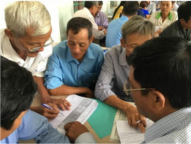
Village meeting for the selection of shelter tool kit beneficiaries organized in Quang Binh province

Building on good practices of community engagement under previous operations, this operation provides information on the beneficiary selection criteria and process through different ways – posters and local media agencies. In addition, the number of family served with NFIs are also informed through these channels.