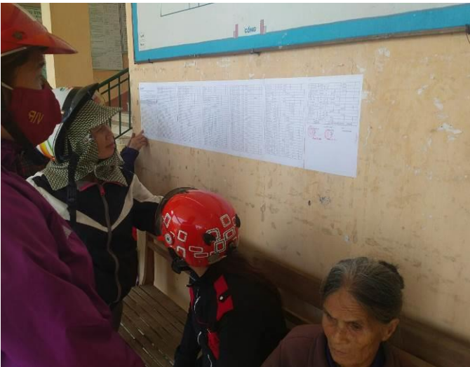
List of beneficiaries made public outside the community house in Hop Trung village of Quang Hop commune, Quang Binh province