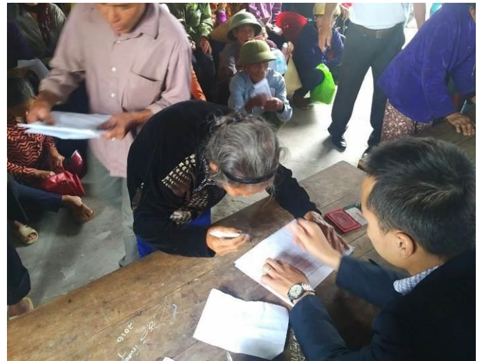
A beneficiary signing off to receive cash grants