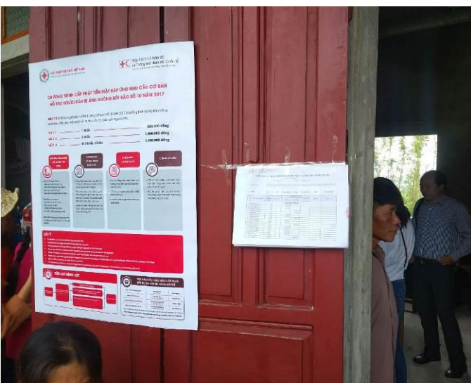
Poster to inform community of the CTP program steps and norms and feedback channels