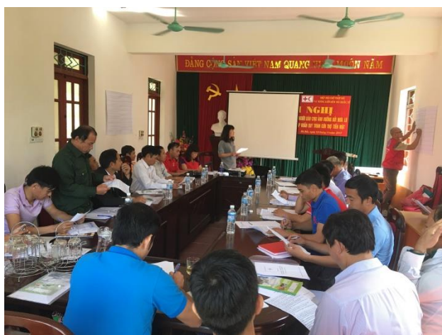
Training on beneficiary selection in Da Bac Hoa Binh province