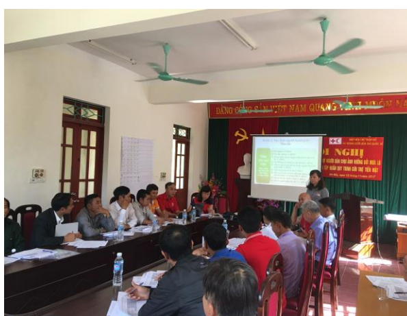
Training on beneficiary selection in Da Bac, Hoa Binh province

In addition, village meetings have been organized in Hoa Binh, Yen Bai and Thanh Hoa provinces on from 13-17 November 2017. After the meetings, the process of beneficiary selection in three provinces started. By 20 November, all three provinces completed the beneficiary selection and targeting process, with 4,089 households identified and