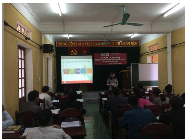
Kick-off meeting and training on beneficiary selection in Van Chan, Yen Bai province

Three kick-off meetings and beneficiary selection and targeting trainings were organized in Yen Bai, Thanh Hoa and Hoa Binh provinces respectively on 9 November, 11-12 November and 17 November. The meetings were attended by 178 participants (153 male and 25 female) including those from the Provincial Red Cross chapters, Communal Government, District and Commune Red Cross branches, Local Social Associations at communal level and Chiefs of Villages.