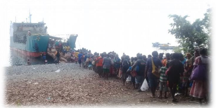
People of South Pentecost line the shoreline of Pagi village to the boat bidding farewell people from Ambaes who have been with them for the past 3-4 weeks.