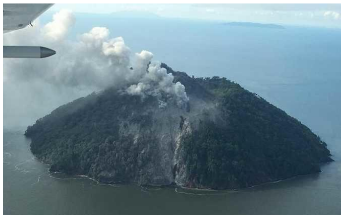
Volcanic activity in Kadova Island on 6 January 2018.

As of 6 January, prevailing wind conditions have carried ash clouds west of Kadovar island. Kadovar (Kadovar) is a small island belonging to the cluster of islands referred to as Schouten Islands. Kadovar is approximately 100km from Wewak (line of sight) and 24km to nearest point on mainland East Sepik province. Kadovar is part of Wewak Island Rural LLG in Wewak District, East Sepik Province. 2