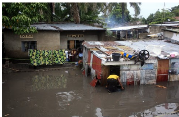
Several latrines have been washed away, and flooded houses like this one require urgent disinfection for people to continue living in it.

The Central Government of the DRC has set up an inter-ministerial crisis committee to manage the present disaster and crisis. The said committee includes the Ministry of Social Affairs, the Ministry of Health and the Provincial Government of Kinshasa. Following the recommendations of this committee, the Central Government has decided to cover the costs and other processes relating to the burial of the people who died as a result of the disaster. The Central Government is also looking to move the populations of some neighbourhoods to new locations, and provide assistance to affected people. The Government has decreed two days of national mourning, and the Prime Minister toured the affected localities to comfort the affected populations.