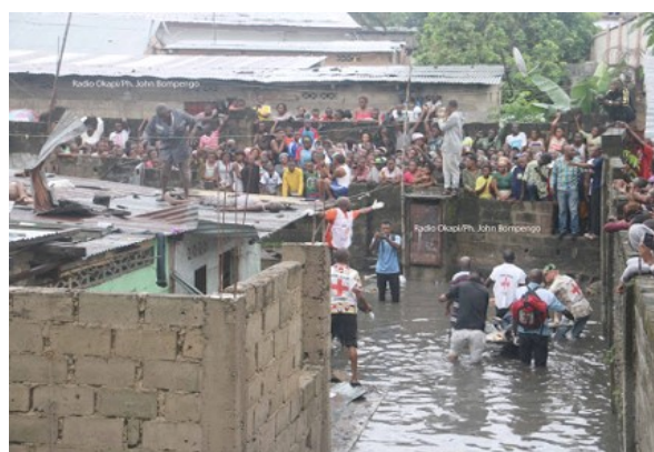
Rescue operation by DRC Red Cross volunteers in Galiema.

The disaster caused the destruction of 465 houses, left 17 people injured, and claimed 51 human lives. In total, 15 743 people (2,624 households) were affected by the disaster in many ways. Most of them have lost their basic necessity property, including school supplies for students. Several latrines and septic tanks have been washed away, a cholera treatment centre was also flooded, and 2,310 households are affected by the disaster. One of the 9 communes affected by the floods is Galiema, which is said to be the epicentre of the cholera outbreak that is currently raging in Kinshasa. There are fears that the flooding will accelerate the spread of the cholera epidemic in the entire Kinshasa province. National forecasts indicate that more rains, under the influence of cyclones from Madagascar, are to be expected until March 2018. Should this happen, more damages are to be expected. The following table summarises the damages registered following the present flooding in Kinshasa province: