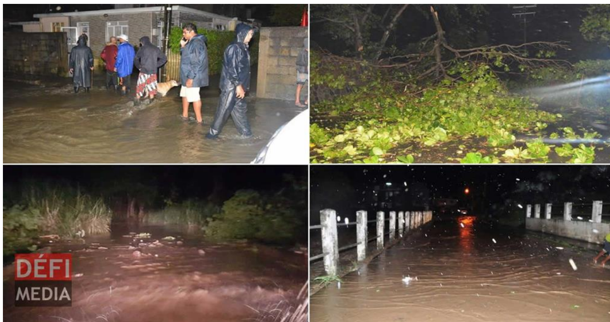
Flooding after the storm made landfall

The tropical storm affected at least 10,000 families with approximately 3,600 people evacuated and accommodated in 57 of the 171 evacuation centres opened by the government in anticipation of the cyclone making landfall.