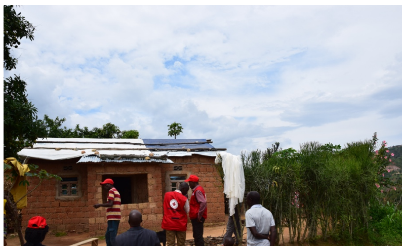
RRCS staff and volunteers visit a house whose roof was damaged by the storms.

On 17 th September 2017, at around 15:30 local time, the districts of Rusizi, Nyamasheke, Huye and Bugesera, Gicumbi, Ngoma, Kirehe, Rubavu and Nyabihu experienced heavy rainfall associated with heavy storms, which resulted in destruction of houses and community farm lands. The affected areas were mostly in five districts; two located in western province (Rusizi and Nyamasheke), two located in Eastern province (Ngoma and Bugesera), and one in the Southern Province (Huye). This was the second time in 2017 where RRCS dealt with this kind of disasters., In April – May 2017, there was a