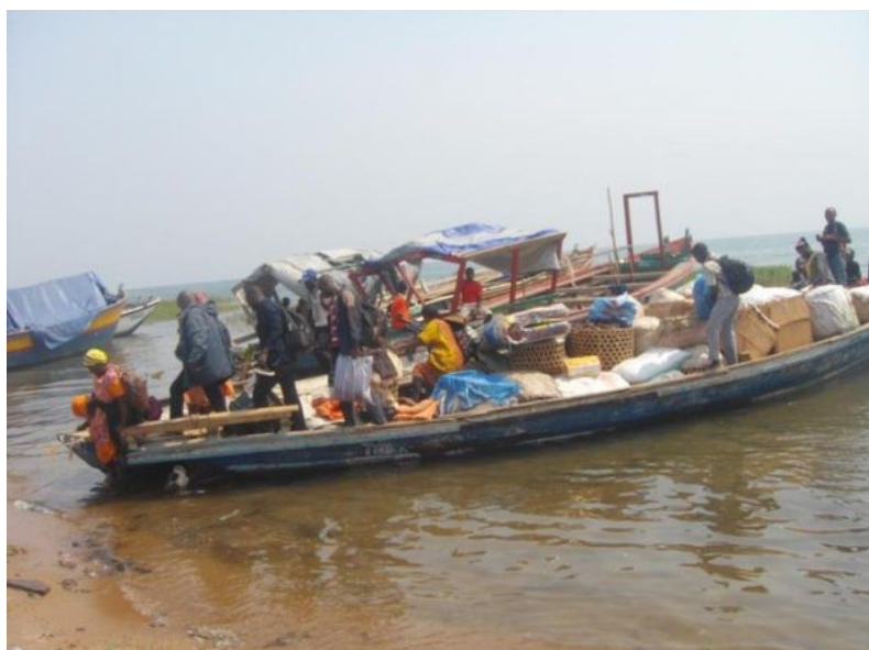
Boat arriving at Burundi's shores with DRC Refugees on Tanganyika Lake

Burundian authorities in Rumonge and Makamba provinces have been overwhelmed by the massive refugee influx and are unable to provide sufficient assistance to the newly arrived refugees, resulting in requests for immediate humanitarian assistance.