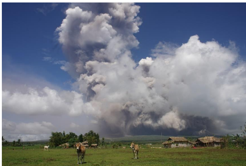
Mt. Mayon in Albay province spews thick ash, releasing harmful materials into the air. Families within an 8km danger zone were evacuated by the Philippines government after the eruption. Currently, almost 65,000 people have left their homes, with most living in evacuation centres across the province, ( Photo: PRC/IFRC )

The DSWD reported that PHP 114.74 million (CHF 2.29 million) worth of assistance has been provided to affected families – most of which coming from humanitarian agencies and the DSWD, with NGOs and LGUs also providing support.