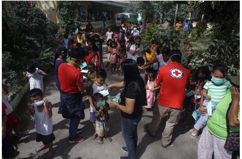
Distribution of face masks in Lower Binogsacan Elementary School in Guinobatan municipality, Albay to provide protection to evacuees and school staff acting as camp administrators, (Photo: PRC/IFRC)

In the evacuation centers, there are number of people who were already experiencing acute respiratory infections (ARI), hypertension and other diseases. PRC initially planned to put up emergency field hospitals (EFHs) for treating people at the evacuation centers. However, the government is able to provide adequate medical aid, eliminating the necessity for PRC to put up EFHs