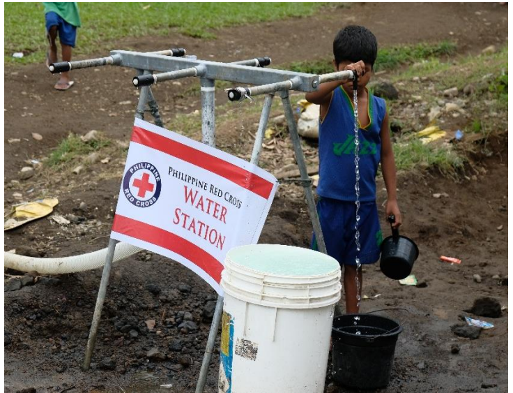
PRC Albay chapter, with support from other chapters, installed water bladders in evacuation centres and continue to provide water through tankers. Continuous need to support provision of water is foreseen until families return to their homes, (Photo: PRC/IFRC)

At country level, PRC and IFRC consistently participate in meetings of the Humanitarian Country Team (HCT) held both during disasters and non-emergency times. PRC and IFRC are involved in relevant government-led cluster information sharing, planning, and analysis at all levels while IFRC supports PRC coordination efforts through representation in other relevant clusters as required.