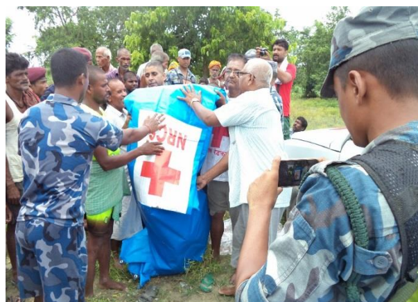
Tarpaulin distribution in Saptari District.

23 March 2018: The IFRC revises the Emergency Appeal to 2,962,956 Swiss Francs to reach an estimated number of 80,282 people which covers both the relief and recovery phase.