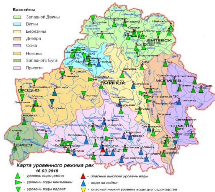
Hydrological regime of rivers in Belarus, as of 16 March 2018

The Ministry of Emergencies predicts that 140 villages and towns and 36 gardeners' partnerships will be affected by floods in a total of 43 districts. In addition, 70 road segments and 15 bridges, and at least 6,600 garden cottages are estimated to be flooded in the next two weeks. The water level of rivers is rising, with ice still covering the rivers Western Dvina, Dniepr, Berezina, Sozh, as well as the Vileiskoe, Chigirinskoe, Zaslavskoe, Soligorskoe, Krasnaya Sloboda water storages, and the lakes Drivyaty, Naroch, Chervonoe. With the melting of ice, significant increases of water levels are expected. Snow is still on the ground in some districts, reaching up to 20 cm. As of 21 March, it was also snowing, which has further worsened the situation with thawing. The daily water-level fluctuation in the rivers is on average 12 cm. In many rivers, the level of water is already above bottom land. Rivers Pripyat, Sluch and Ubort will reach the crucial level of water within a few days. The most critical areas are the ones near village Chernichi, in Gomel region. 1,356 houses are fully or partially flooded.