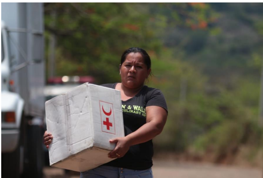
Photo 2: A women carries her hygiene kit, after the distribution carried out by the SRCS, in La Union department.

The procurement plan is to replenish the NFIs, hygiene kits, blankets and tarpaulins as per the needs in the identified affected areas. The coverage of these items will be from the National Society's pre-positioned stocks, and the replenishment will be at the regional level procured. The NFIs that were used during the disaster response, which will be replenished through Panama.