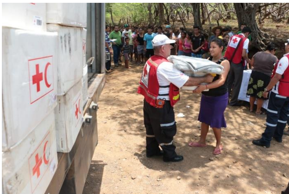
Photo 1: A woman from the affected locality of Intipucá receives relief items (hygiene kit, blankets and tarpaulin) from the Salvadorian Red Cross Society.

Some 733 seismic events occurred between 5 and 9 May, as reported by the National Seismic Network. The epicentre area was located between the municipalities mentioned above. Ninety-five of these earthquakes, whose magnitude range between 2.4 and 5.6, were felt by the population. The strongest of these earthquakes (magnitude 5.6 and intensity VII) was recorded on 6 May at 1:02 p.m. in Chirilagua and Intipucá. It caused severe damage to homes made of mud, adobe, or wattle and daub.