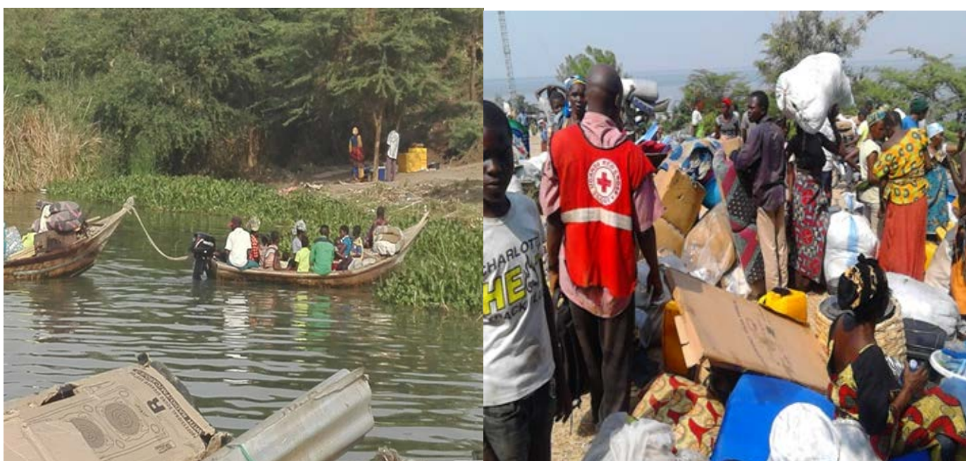
Figure 1: Uganda Red Cross volunteers receiving newly arriving refugees at L. Albert - Kanrara landing site, Ntoroko district.

The IFRC Emergency Appeal Operation supports the URCS activities in Kyangwali refugee settlement. The URCS operation in Kyaka II, Ntoroko landing site and Kagoma reception centre are funded by other partners, including UNICEF and the Netherlands Red Cross. The Austrian RC supports safe water production in Kyangwali and the Belgium RC supports preparedness activities and branch capacity building for the 4 branches supporting the URCS DRC refugee operation.