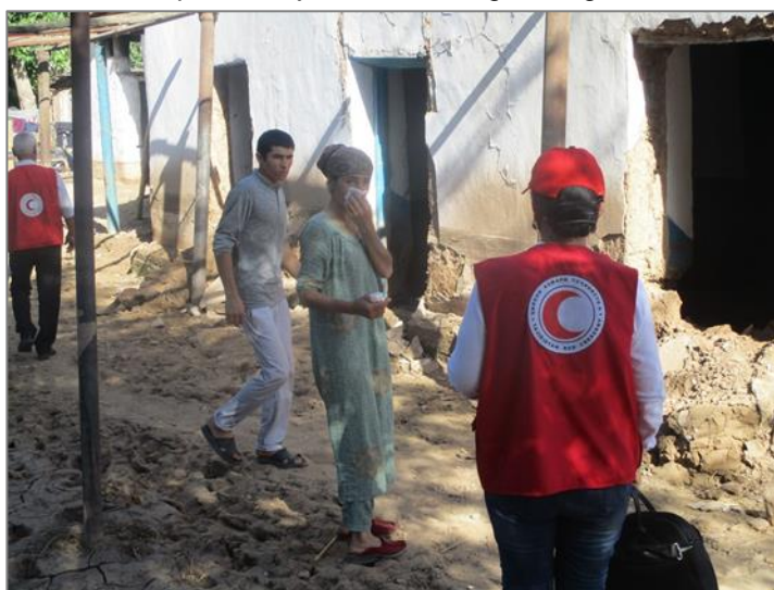
The RCST team is conducting a needs assessment.

In Sughd Province around 3 ha of arable lands, 800 m of village internal roads and 10 ha of land plots in Ruzi obnok village of Penjikent and 51 km of motorway and irrigation channel were destroyed damaging 300 m of pipes. The main road connecting Kurgoncha village of Jabbor Rasulov district with the district centre town was blocked. A pedestrian bridge constructed under the RCST "Transborder" programme in that village was destroyed. Floods and mudflows in the Province caused 8 casualties, mainly due to population's negligence.