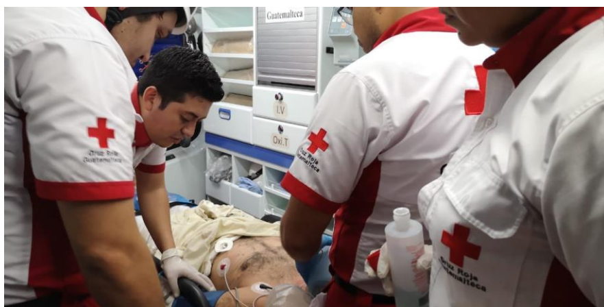
Photo: Attention of affected people. 5 June 2018.

Volcanic ash continues to fall on communities such as La Soledad, San Miguel Dueñas, Alotenango, Antigua and Chimaltenango. The level of alert has been increased to red in the following departments: Escuintla, Alotenango, Sacatepéquez, Yepocapa and Chimaltenango, and CONRED opened three collective centres in the department of Escuintla. Local authorities said the volcano could cause more mud and pyroclastic flows, and heavy rains threaten to worsen the volcano's impact by causing rivers to overflow their banks.