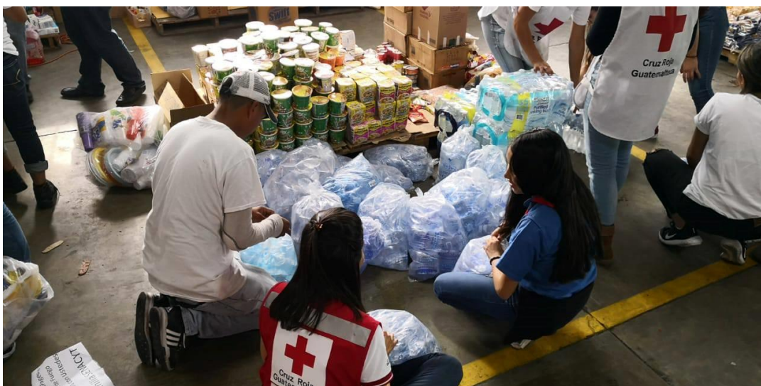
Photo: Coleccion centre. 5 June 2018.

The GRC deployed assessment teams on 3 June. While the GRC is still compiling the and analyzing the data, the immediate needs are evident. At risk communities need to be persuaded to leave their homes, livestock, and assets and be evacuated to safe areas. Consequently, there is a need to develop a communication plan, along with key messages, to persuade people to evacuate to safety.