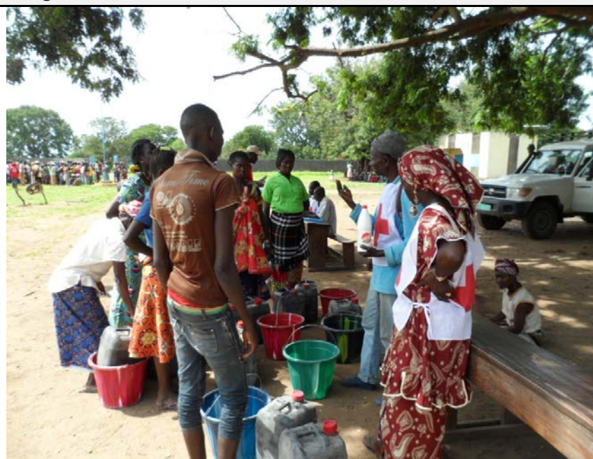
Awareness raising on use of NFIs - Began, Goré