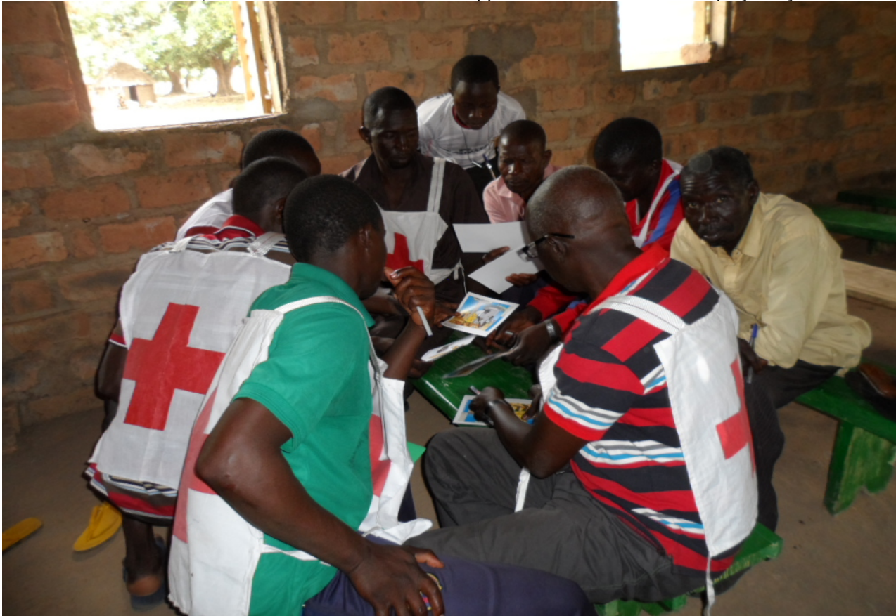
Training of RCC Volunteers on Wash - Goré.

The RCC has deployed a WASH focal person who is part of the DREF implementation team. Throughout the implementation of the DREF, the latter will benefit from the support of the WASH RDRT deployed by the Dakar office.