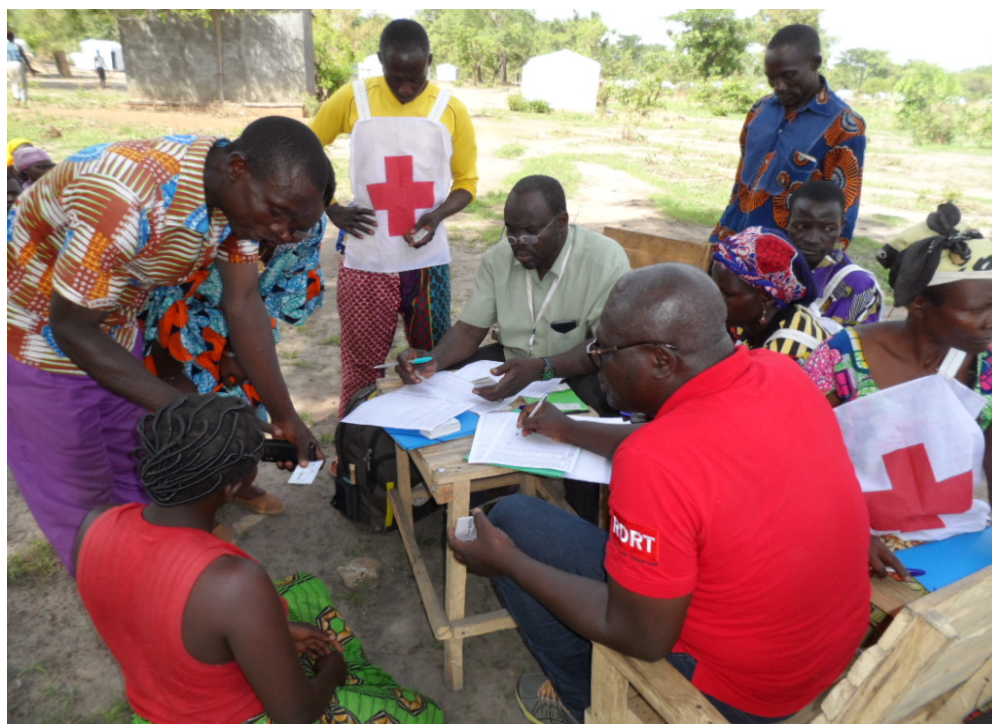
Distribution of Identification Cards to beneficiaries - NFI distribution (Bekan, Goré)