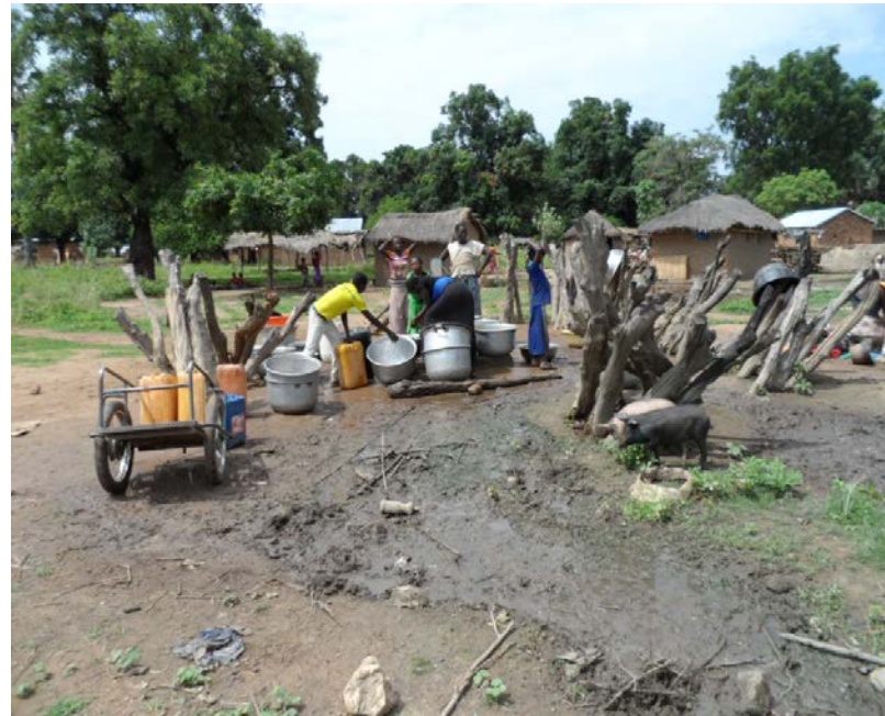
Borehole identified for rehabilitation

To date, four (4) water points have been rehabilitated in Began, Bekoninga and Oudoumian. At the end of the operation, these boreholes will be formally handed over to the WASH committees, in presence of village chiefs and community, as they will henceforth be responsible for educating on use and maintenance.