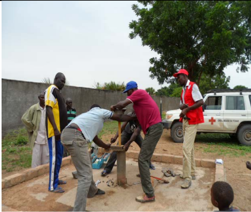
Assessment of borehole for reparation, Began