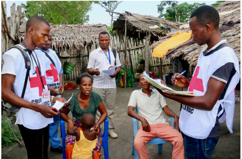
Photo: DRC volunteers conducting community sensitization campaign

14 June 2018: The Emergency Appeal is revised seeking 7,879,764 Swiss francs to assist 400,000 people for 6 months.