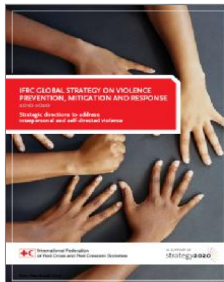
Global Strategy on violence prevention, mitigation and response 2010-2020. IFRC

This report covers the period 1 January to 30 June 2011.