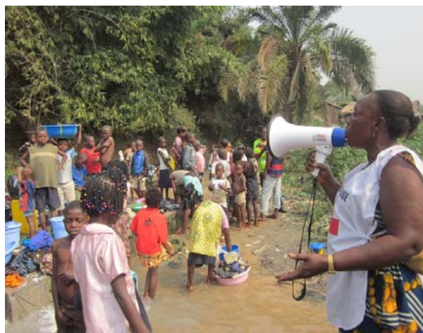
A Red Cross volunteer talks to the public at a water collection point in Kinshasa while a young boy holds on his chest a leaflet distributed by RC of DRC.

Working closely with the Ministry of Health (MoH), UN Agencies and National and International NGOs, the Red Cross of DRC mobilised 900 First Aid volunteers and community animators to provide cholera awareness messages to populations at risk. In addition, houses of families affected by cholera or at high risk were disinfected. During the reporting period, the team reached more than 1,150,000 people with awareness messages and through disinfection of 2,000 houses (around 18,000 people), 20 boats, 250 latrines, and 20 market places, health centres and churches.