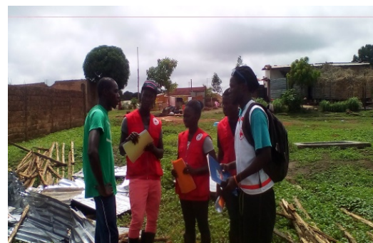
Red Cross volunteers conducting Needs