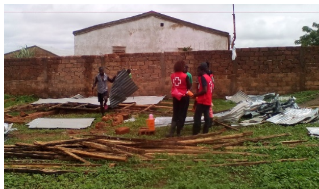
Many houses collapsed due to Storm

In Bissau the capital, about 2,000 families were affected, and 420 houses were destroyed. Three (3) deaths were also reported. Approximately 800 people were displaced in other regions. The most affected areas are: Bissau, specifically, the districts of Antula, Militar, Bor, Bairro Reno, Cuntum and Praca, and the regions of Bubaque, Bolama, Biombo, Oio and Sao Domingos.