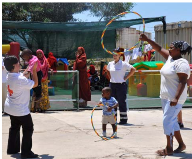
Malta Red Cross volunteers organising activities for refugee children.

The Canadian Government contributed CHF 21,505 to the implementation of this operation. The major donors to the DREF are the Irish, Italian, Netherlands and Norwegian governments and ECHO. Details of all donors can be found on: : http://www.ifrc.org/what/disasters/responding/drs/tools/dref/donors.asp