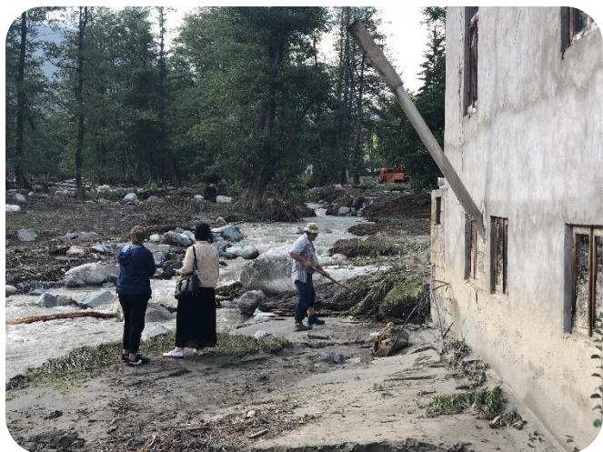
Image 2. Flooded house in Chuberi community

Due to the rain, the roads connecting Chuberi villages was totally destroyed. All the relevant structures are involved in disaster liquidation works in Chuberi community.