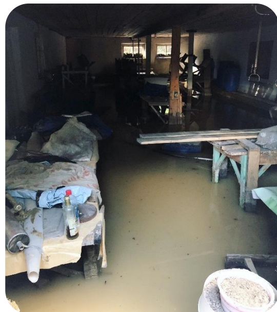
Image 3. Flooded house with belongings in Chuberi.

After the disaster, a task force was established in Chuberi Community, which consisted of local authority representatives, Emergency Management Service, National Environmental Agency, Ministry of Infrastructure and Regional Development,