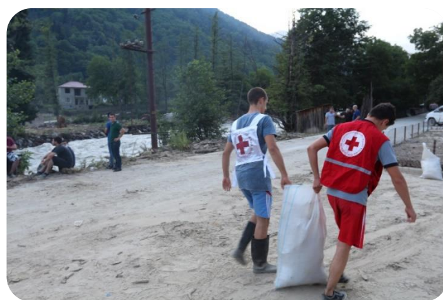
Image 4-5. GRCS Mestia Branch volunteers cleaning stadium in Chuberi.