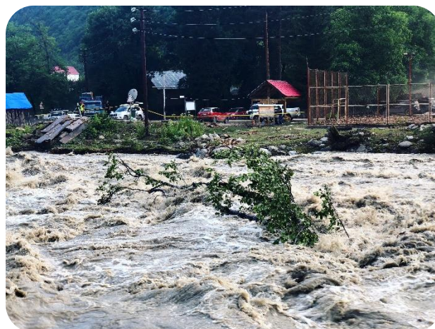
Image 1. Flooded area in Chuberi community

Houses of 60 families have been partially destroyed; they also lost their belongings – food stocks, household items, furniture, cattle and poultry – and have been accommodated at their relatives'. Three families' houses have been totally destroyed, including all of their belongings.