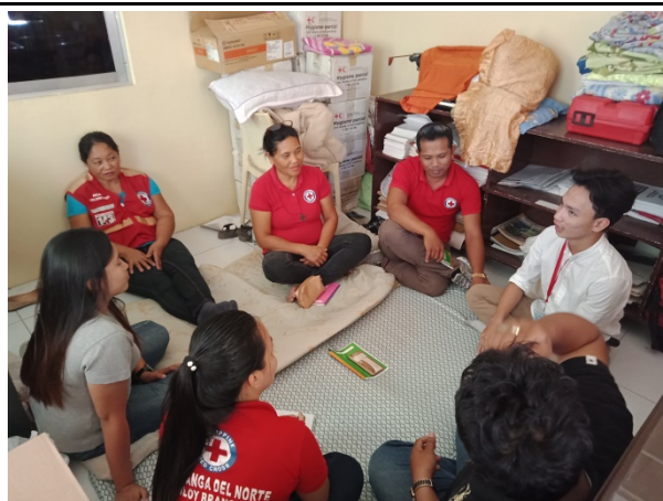
Volunteers shares how they managed stress in the session for critical stress management during the PSS training.

Staff and volunteers mobilized for PSS activities were also trained. In Zamboanga del Norte Chapter, 25 volunteers (16 female and 9 male) were trained for PSS and Restoring Family Links on 26-28 March. In Lanao del Norte, a PSS crash course was conducted for four female volunteers. These activities are part of capacity building for chapters.