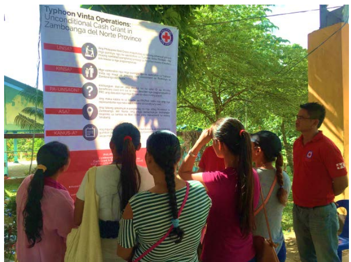
Information about the unconditional cash grant assistance is made accessible to beneficiaries and non-beneficiaries to let them fully understand the programme. Information was translated to local dialect for full understanding of the targeted people. IEC materials posted in communities have PRC contact details where people can refer to for feedbacks or queries.

In the completed PDM for the non-food and cash assistance, out of the 674 respondents, 42 per cent said that they have access to the local PRC chapter while 46 per cent mentioned that they have other means of reaching PRC. Only 28 per cent used the feedback mechanism of PRC wherein 75 per cent of them received a response. Overall, 98 per cent of the total respondents were happy in the process of selection, distribution and feedback mechanism.