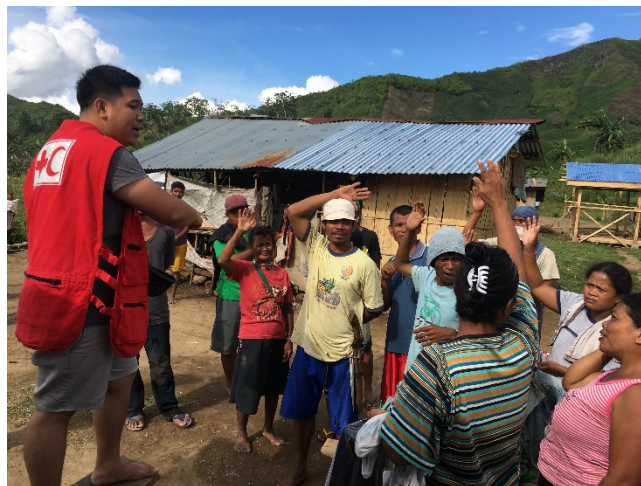
Beneficiaries for shelter programme meets with IFRC and PRC during the consultation and planning for site development of the relocation site in barangay Digongan, Kitaokitao.

PRC, with support from IFRC, is currently drafting the Housing, Land and Property (HLP) Strategy which would become an integral part of every shelter assistance operation. For this operation, PRC tested some parts of the draft strategy for the shelter assistance and have oriented shelter beneficiaries about security of tenure. The PRC is coordinating with the local government unit (LGU) to discuss the issue of relocation and land tenure. The LGU has been very supportive to the beneficiaries to acquire land and has also been supporting with lumber and aggregates. For the advocacy work, the team conducted a community visit and discussed the intentions and objectives of PRC in providing awareness about HLP, which is to help ensure that they are “protected”. The importance of understanding one’s rights over shelter and land (tenure status) was explained as well as the importance of having a clear documented agreement on shelter and land rights between landowner and beneficiary, eliminating the risk of evictions.