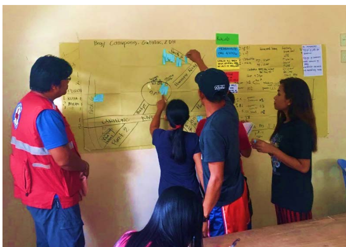
Community members in barangay Canupong, Gutalac, Zamboanga del Norte, personally lead in the social mapping exercise in the identification of beneficiaries for HLA. This exercise is also used so that community members will be able to understand the effect of disaster to their community.

Registration of households was conducted using the Open Data Kit (ODK) – a mobile data collection tool. The selected households submitted proposals that were then validated by PRC technical staff for feasibility before being approved. Through cash transfers, the assistance for livelihood worth PHP 10,000 (approximately CHF 200) will be disbursed in two tranches. The first tranche constitutes 60% of the total assistance, then the second tranche – 40% – will only be provided once the beneficiaries are able to spend the assistance based on what is stipulated on the agreement for HLA. In partnership with PHLPost – a government-owned and controlled corporation responsible for providing nationwide postal services in the Philippines – cash disbursement is planned for the last week of June.