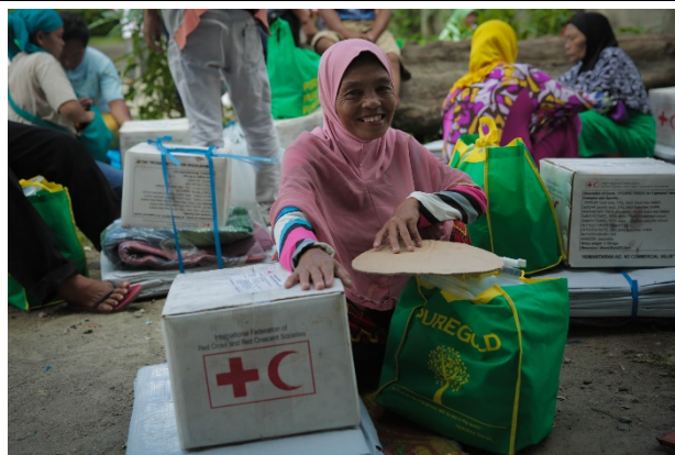
A woman smiles after receiving a hygiene kit and non-food items during the relief distribution in Salvador, Lanao del Norte.

Through the appeal, IFRC supported PRC distribution to 1,792 households (8,960 people) in 14 municipalities of Bacolod Kalawi, Madalum (in Lanao del Sur); San Fernando (in Bukidnon); Kapatagan, Lala, Maigo, Salvador, Sapad, Tubod (in Lanao del Norte); Gutalac, Labason, Liloy, Salug and Siocon (in Zamboanga del Norte). IFRC also supported the mobilization of PRC staff and volunteers, and logistics and transportation for all the response activities.