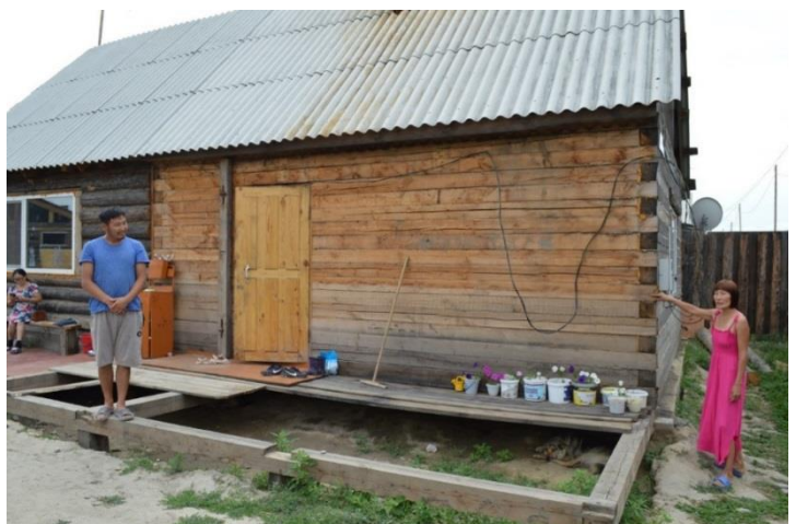
Kaa-Khem, Tyva , July 2018.