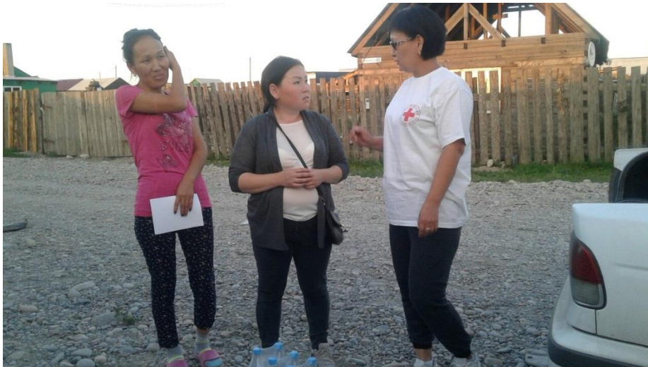
Kaa-Khem, Tyva Republic, July 2018.

Flooding affecting several villages in Tyva began in late March, with a local disaster officially declared on 23 March. Rapid warming continued to increase rates of snow thaw, and extensive amounts of water came down from the mountains, as well as from swampy areas. The disaster continued to expand, prompting the declaration of an emergency situation in Kaa-Khem village (Kyzyl Region), where, in the beginning of April, a water dam was partially destroyed by flood water, and local attempts to cope with the situation remained unsuccessful. The water overflowing the dam inundated sewage treatment plants, mixing sewage with thawed