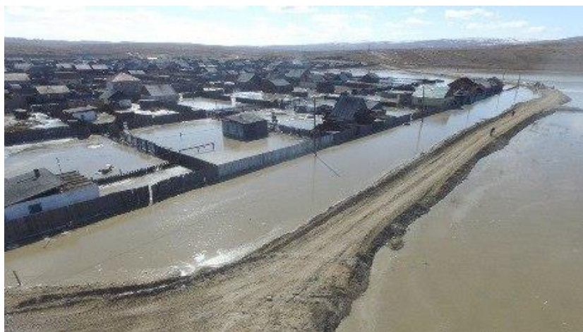
Flooded residential area in Volgograd region, 25 April 2018.

In South Siberia (Tyva Republic and Altai Krai Region) and in the southern part of European Russia (Volgograd Region), because of rapid snow thaw and runoff of meltwater into riverbeds, water levels rose significantly from late March 2018 onwards. As of 16 April, 11,550 people were severely affected by the floods, with belongings and stocks destroyed. The most essential and badly-needed help was food and hygiene products.