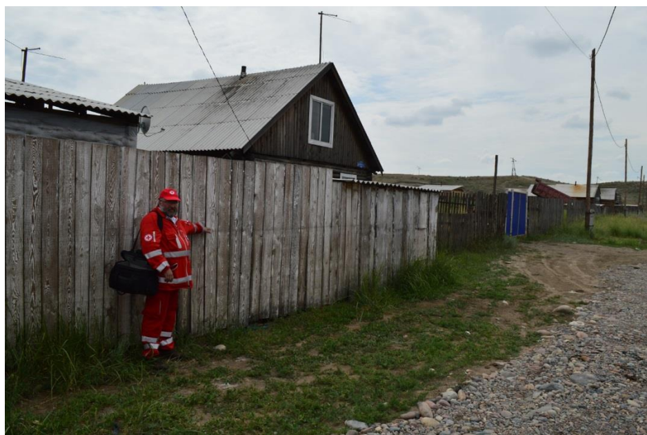
Kaa-Khem. Tyva Region, July 2018.

The flood has receded by now, and most people have returned to their homes. Some people have started to repair their houses while other people still live with their relatives due to significant damage incurred, and lack of resources. Many people are not eligible for the support from local authorities (please see below), and a lot of people receive very low level of support that does not exceed CHF 200 – people therefore have to find their own resources, and rely on help of their neighbours and friends, to repair their houses.