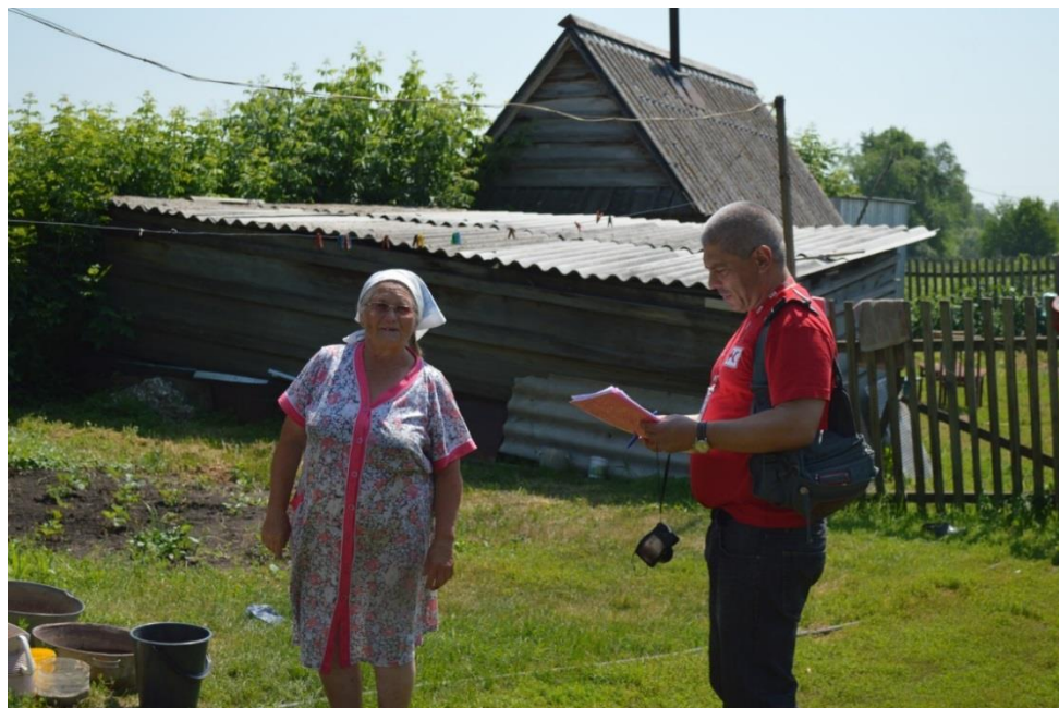
Altai Krai, Monitoring by IFRC, July 2018.

During the emergency phase, support and management of information was being organized in a centralized way by the EMERCOM. After the flood waters receded, the emergency status has been lifted and the centralized system of EMERCOM has been removed. The centralized system had allowed for a more coordinate information collection and information flow with all affected areas and local authorities which was fully managed by the EMERCOM. After the system was withdrawn it became necessary to establish direct contacts between the regional branches of RRCS and numerous local authorities located at significant distances from each other and from the centre. The information flow was eventually established, but it took a considerable amount of time which has also affected the implementation time-frame.