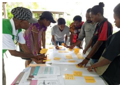
Polio outbreak control training for volunteer using the ECV toolkits, (Photo: PNGRCS)

Papua New Guinea Red Cross Society has started to address the needs of the affected communities in July 2018 with the public awareness at the risk populations together with the national health department and the social mobilization for polio vaccination campaign. PNGRCS is working in close coordination with health local authorities, health clinics and community leader in conducting need assessments, monitoring the situation, providing the referral symptoms of disease and socializing the polio vaccination as well as good health practices to reduce the risk of disease transmission. In total 21,559 beneficiaries have been covered by the PNGRCS in the first round of polio vaccination campaign through public awareness and social mobilization in three affected provinces: Morobe, Madang and Eastern Highland. Though support from IFRC, PNGRCS has continued its collaboration with national government actors in country.