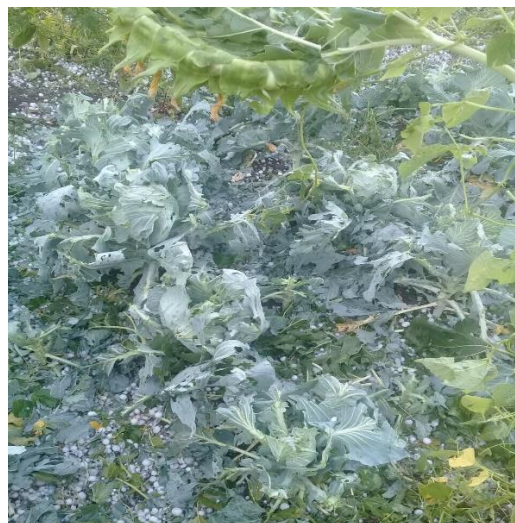
Destroyed plants after a severe hailstorm in Armenia.

The Armenian Red Cross Society together with its Shirak Regional branch conducted several meetings with regional authorities, obtained all available official assessment reports and in its turn organized needs assessment in some of the affected 11 communities. After meeting with regional government representatives and presenting ARCS's planned activities, ARCS developed beneficiary selection criteria. Afterwards, ARCS assessment team had additional meeting with local authorities from the three most affected communities, and presented the selection criteria to them, based on which they were assigned to prepare a list of affected people/families. Additionally, ARCS organized a meeting with the Ministry of Emergency Situation and Shirak regional administration and agreed to share all information and coordinate activities in the affected region.