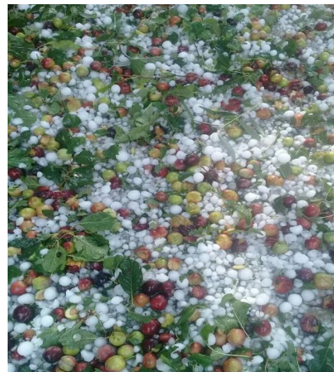
Hail damaging crops and fields in Armenia.

It is estimated by the Ministry of Agriculture that the affected communities total damage adds up to 903.54 million Armenian drams (approx. 1.9 million USD). The provincial commission visited the disaster area, trying to estimate the amount of damage. The Government is committed to support the commercial losses reported by farmers. In addition to these losses, the rapid assessment teams found that home garden production was also affected, and impacting on household food security.