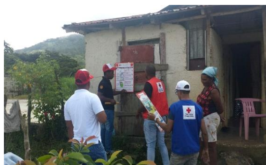
DRC Volunteers conduct a home visit.

In comparison, the province of Independencia, which accounts for only 0.77 per cent of the Dominican Republic's total population, has seen twice as many suspicious cases (91 versus 46) of cholera as the rest of the country in the last two months. Moreover, the presence of suspected cases in this province is 300 times higher than in the same period of 2017, and this is the only province where the suspected cases of cholera have increased in relation to 2017. These data