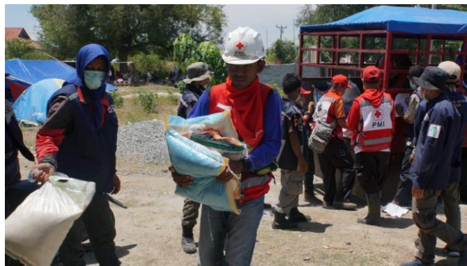
Distribution of relief items on 29 September 2018.