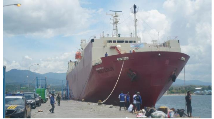
Vessel arrives at the port in Makassar on 7 October 2018 carrying PMI's NFIs including tarpaulins, blankets etc.

Palang Merah Indonesia (PMI) is leading the earthquake and tsunami operation with the support of IFRC, and Partner National Societies (PNSs) using the Federation-wide Operating Framework (FWOF). The framework outlines the platform to enable a concerted effort from the IFRC and PNSs to support the operation through PMI's One Plan via four main pillars; i) multisectoral emergency response, ii) multisectoral early recovery, iii) community resilience and iv) local actor capacity enhancement. Simultaneously, to ensure smooth implementation of the operation, IFRC is supporting PMI in setting up Welcome Centres to record and updating incoming regional and global tools, support services (administration, finance, human resource and legal), supply chain management and as well as coordination at various levels that include coordination with IFRC Geneva and regional office, Jakarta, field and civil military relations. IFRC is also supporting PMI in coordinating partnership meeting in November 2018. To ensure efficiency and accountability for all implementing partners supporting PMI through the agreed operating model, Federation-wide reports will be issued, and evaluations will be carried out.