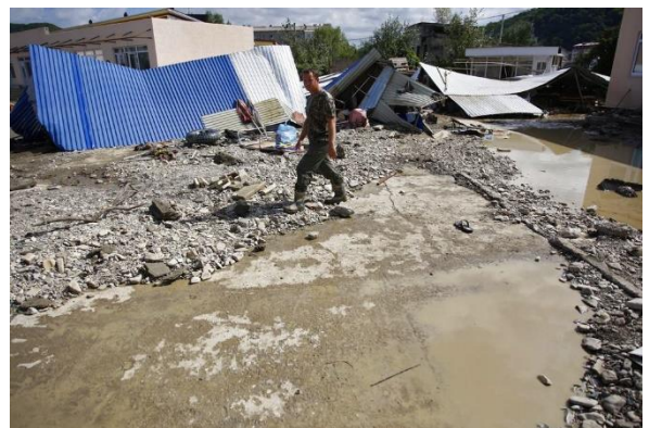
Flooded area in Krasnodar Krai, 27 October 2018.