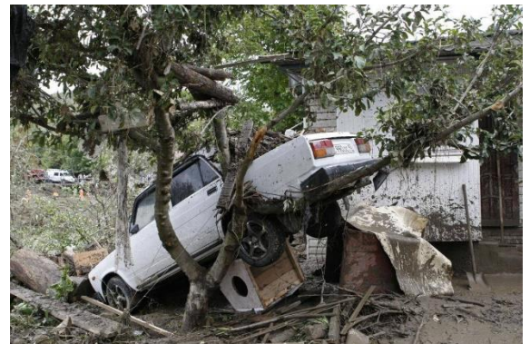
Flooded area in Krasnodar Krai, 27 October 2018.

In addition to the above, according to the estimations of the RRC, at least 4,000 people need support but are unaccounted for yet: their houses were not damaged, but agricultural land or livestock was affected. Additionally, there are displaced people from Ukraine and those who do not have a status of permanent residence, but just live in the affected area. These people will also require support in restoring their households. Thus, in total, the estimated number of people affected by the floods is 11,300.