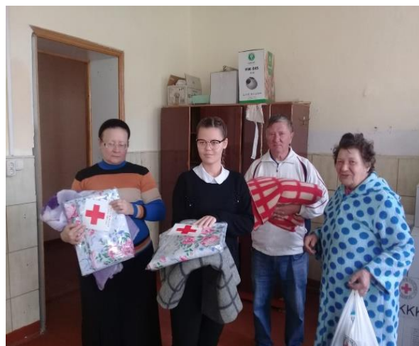
RRCS volunteers assisting residents in Apsheron district of Krasnodar Krai Region.

Cola-Cola in Russia donated 10 MT of drinking water to be distributed to the affected population. The water was delivered to the affected area at Coca-Cola expense, as per global partnership agreement for disasters.