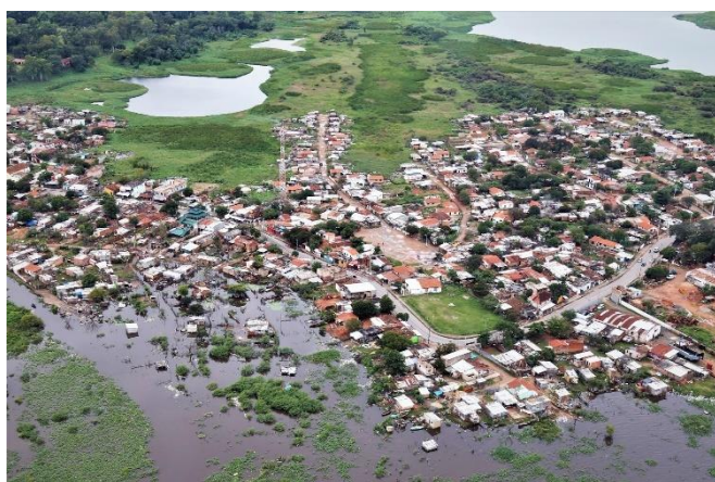
Floods in Asunción's Bañado Sur area.

In Asunción, 30,225 people (6,085 families) were evacuated to 109 temporary collective centres set up by the Municipality of Asunción and one collective centre managed by the National Emergency Secretariat in a military site in Bañado Tacumbú. On 1 November 2018, the Asunción municipal government declared a 90-day citywide emergency. Over the last few weeks, the number of affected people has increased, and the Paraguayan government has had to evacuate them and install improvised temporary lodgings to house them. The rains are expected to continue, putting those who have chosen to remain in their home at risk and threatening to increase the affected population's humanitarian needs. To date, there has been 1,561.7 mm of rainfall in the affected area from 1 January 2018 to 23 November 2018, including a sharp increase from October to November 2018;