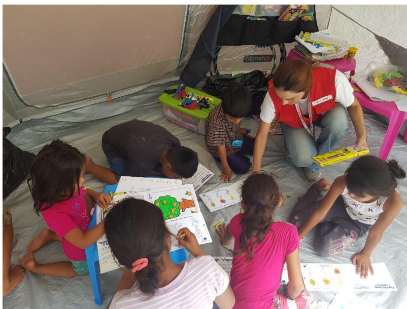
Photo: A GRC staff member conducts a PSS activity with children in a collective centre. Source: GRC

The Guatemalan government is coordinating the collective centres, in which approximately 2,851 people are being housed. The GRC will target 2,250 families (13,500 people) in the departments of Escuintla, Sacatepéquez, Yepocapa and Chimaltenango through the following sectors: