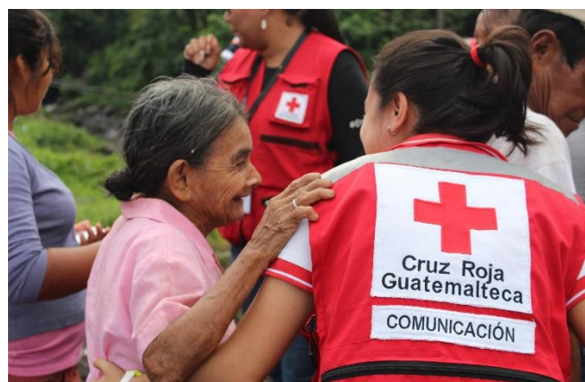
Photo: GRC personnel provide support to an affected woman.

On 3 June 2018, Guatemala's 3,763-meter (12,346-feet) Fuego Volcano erupted, killing 165 people, leaving 260 people missing and injuring 27 people. The volcano emitted an 8-kilometer (5-mile) stream of hot lava and a dense plume of black smoke and ash that blanketed Guatemala's capital, Guatemala City, and other regions. According to Guatemalan authorities, 12,823 people were evacuated from the affected area (please see the map of affected areas); of the evacuated people, 2,851 people remain in collective centres. The fatalities are concentrated in three towns: El Rodeo, Alotenango and San Miguel Los Lotes. A forensic team continues working on the ground to identify any human remains that are found.